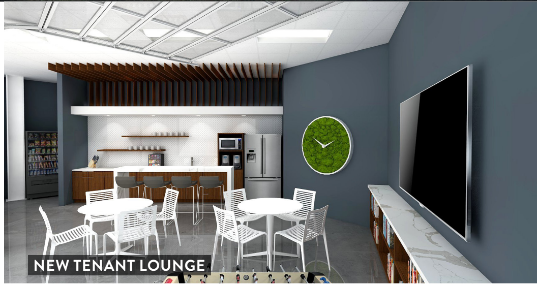
NEW TENANT LOUNGE