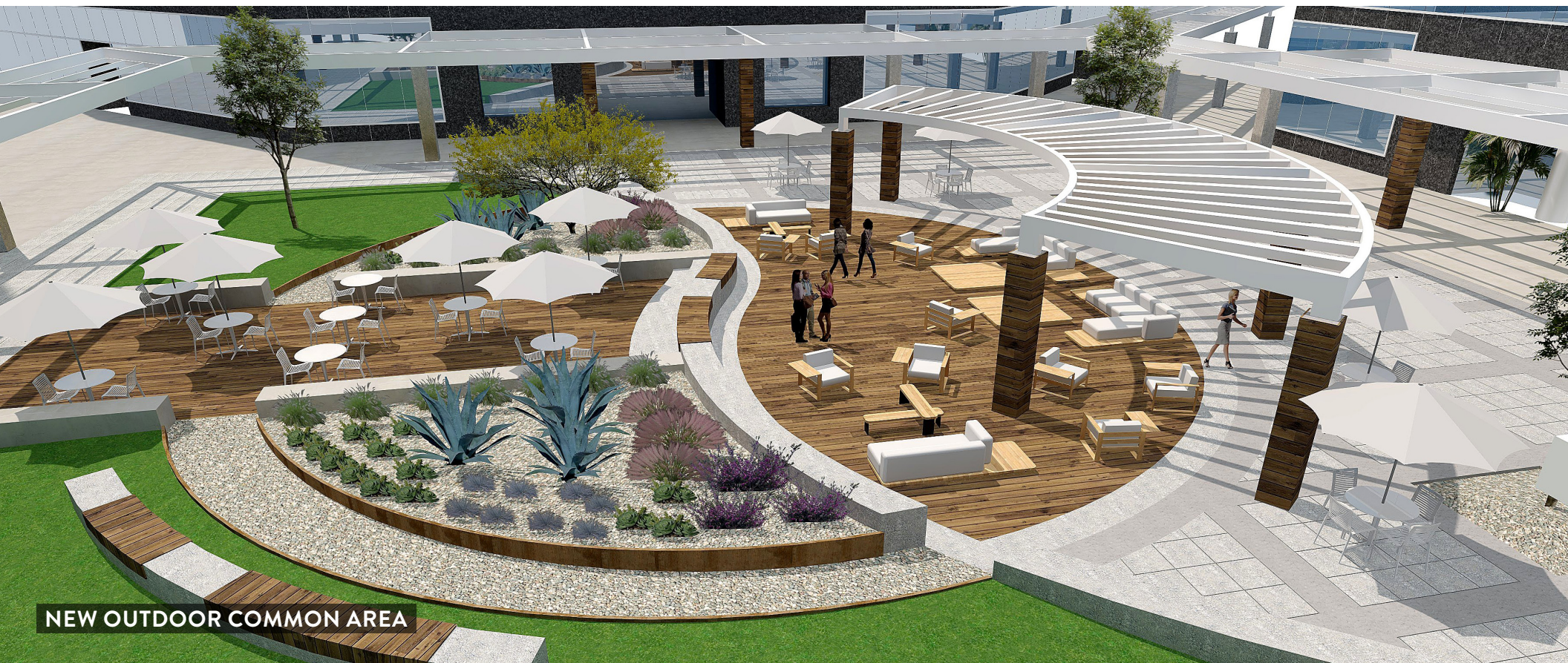
NEW OUTDOOR COMMON AREA