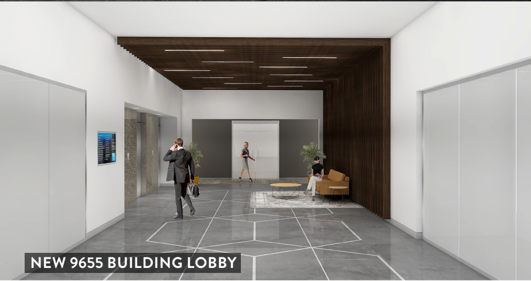
NEW 9655 BUILDING LOBBY